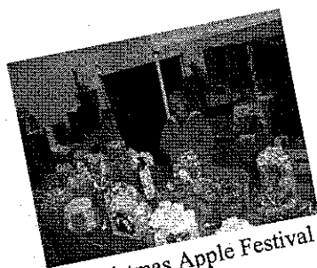
Christmas Apple Festival

Partnered with the City to purchase chairs for the Community Center